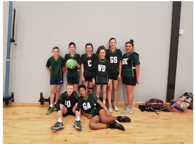
Year 8 Netball at Stadium